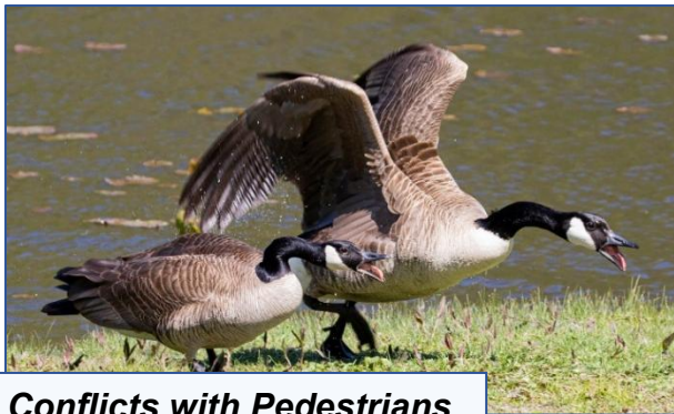
Conflicts with Pedestrians