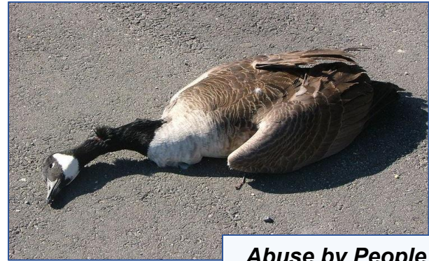
Abuse by People