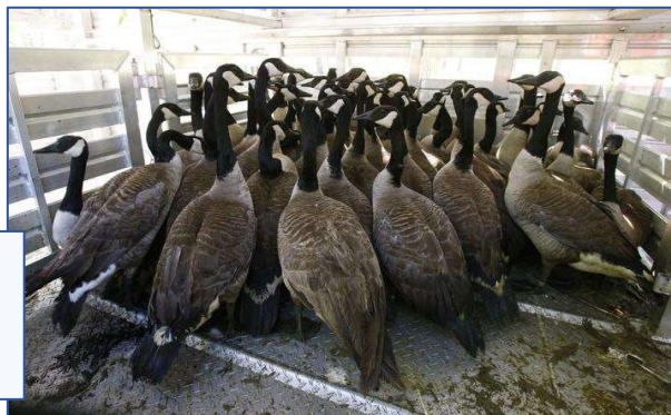
Round-Ups and Slaughter

The only humane solution is to prevent the problems before they start.